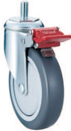
Total Lock (TL)