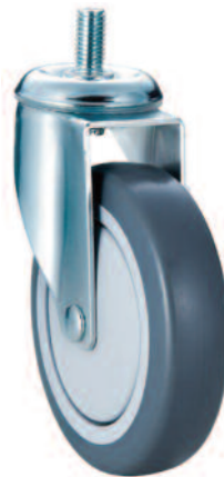
Swivel Stem Caster