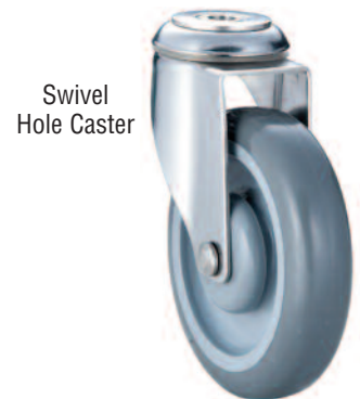
Swivel Hole Caster