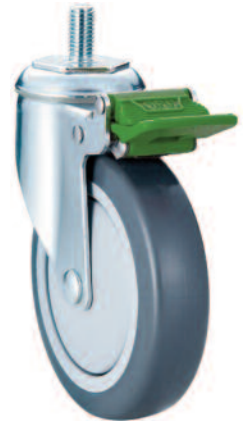
Directional Lock (DL)